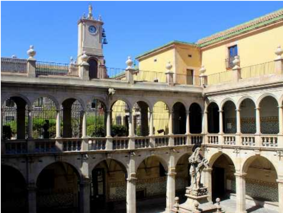
Cloister of the Institut d'Estudis Catalans, where the office is located