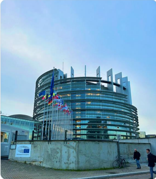
European Parliament and 5 others

#scienceadvice #SAMGroup_EU #EthicsGroup_EU