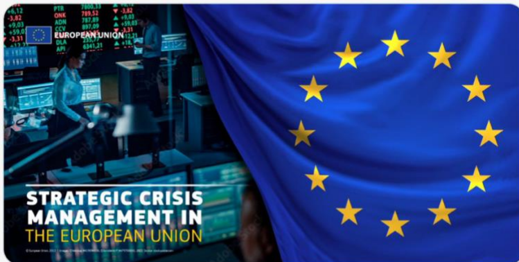
Janez Lenarčič and 6 others

🔴 Follow LIVE ⌚ 10:00 CET ➡ bit.ly/3V2KB21