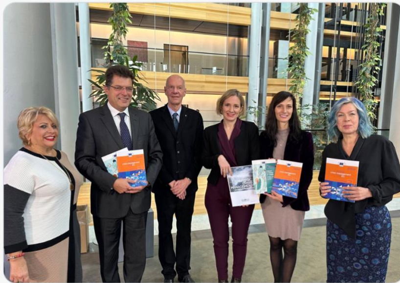
Mariya Gabriel and 5 others

“I want to stress the importance of your independent and multidisciplinary advice. This is not the first contribution you have made to crisis management, you have been with us from the start” - @GabrielMariya